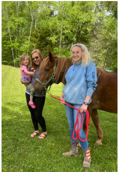
A successful compliance check by our Barn manager/Assistant Director & her daughter.